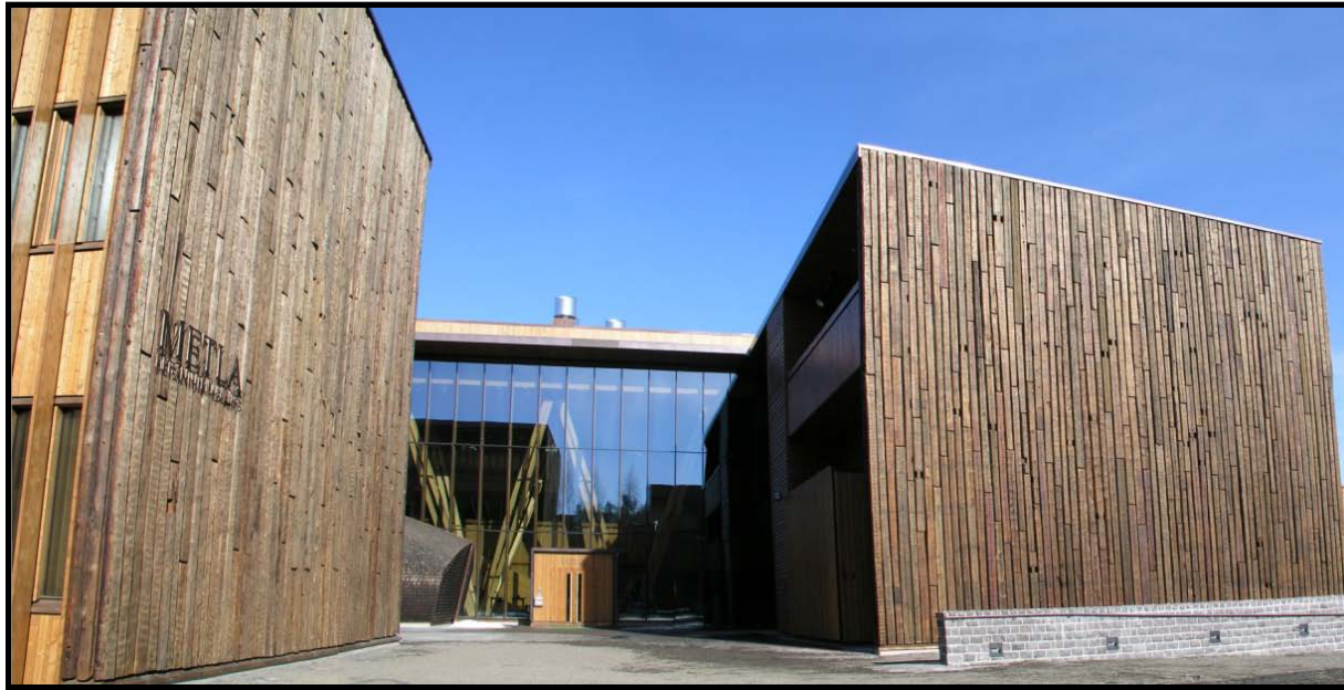
Metla house, Joensuu, Finland: 0.77 ha, office for 220 people

“By purchasing products made from recycled wood, you not only prevent valuable waste from entering landfills, but you also contribute to the demand for manufacturers to continue producing these products” (Earth911.com)